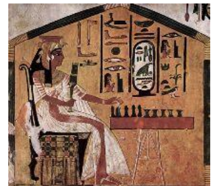
Queen Nefertiti Playing Senet by Unknown

The Ancient Egyptians liked to play board games for fun. One of the most popular board games was Senet. The game of Senet is thought to be over 5000 years old. It was so popular that many pharaohs were buried with Senet boards so they would have something to do in the afterlife.